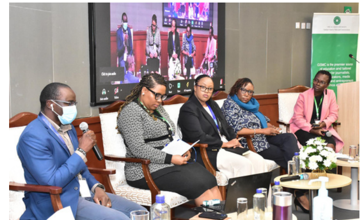
Delegates during the AJEN Conference in Nairobi, Kenya

The final session centered on organizational matters, with AJEN officials providing updates on ongoing projects and discussing strategies for expanding the network’s membership. Delegates from Rwanda, Ethiopia, Somalia, and Zimbabwe attended with support from the Johannesburg office of the Fojo Media Institute, which had representatives present as well. Additionally, CHARM sponsored several delegates for the event.