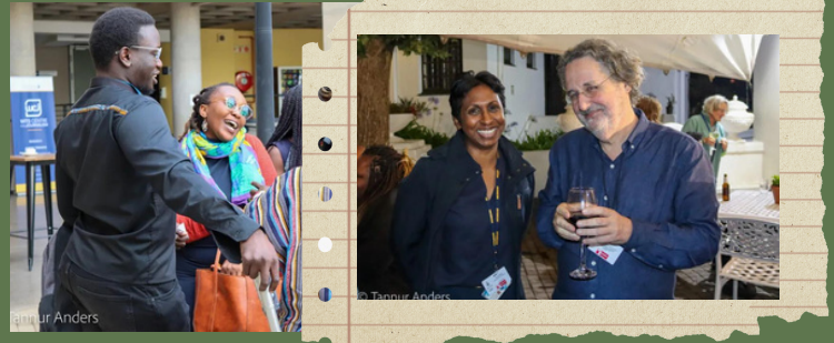
Flashback to the 2022 Conference: Members enjoying a delightful interlude of fun and camaraderie at the 2022 Conference in Johannesburg, South Africa.