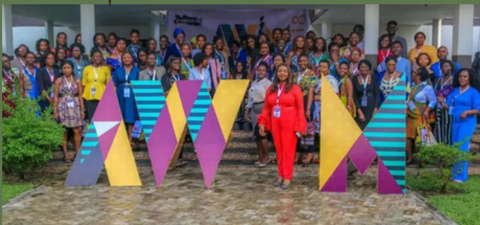
Throwback to last year's AMWIK Conference: A snapshot of empowerment as inspiring women from across the spectrum gather, share, and connect in a celebration of knowledge and sisterhood.

who will keep you engaged throughout the 80+ sessions. Please follow the sessions progress and the interesting events that will be taking place at the conference through #AIJC2023 on all our social media pages.