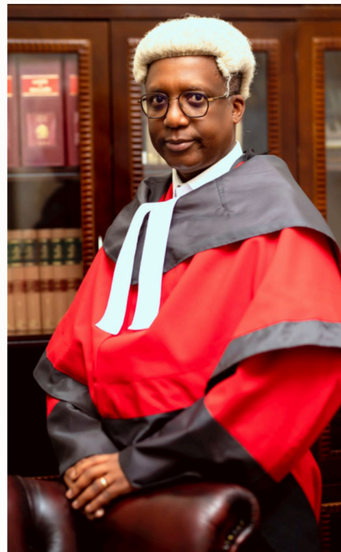
Justice Kachale Mwale, Malawi judge who delivered the landmark ruling on scrapped off section 200 of the Penal Code